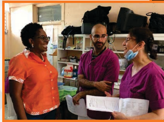
Hygiene techniques to use at home. ▶

Our first Annual Dental Fair was held at Haile Selassie High School. This collaboration between the Member of Parliament and A Child's Smile Project saw over 145 children (0-18yrs). The two day exercise included oral examination, tooth extraction, cleaning and filling. Parents were also given a lesson in good dental